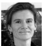
Mariana Mazzucato University of Sussex