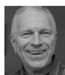
Edmund S. Phelps Columbia University