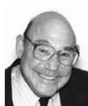
Richard R. Nelson Columbia University